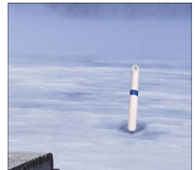
Sully Stick in ice!