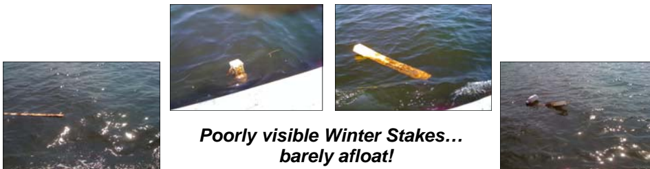
Poorly visible Winter Stakes... barely afloat!